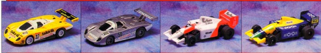
9205 TOYOTA TAKA-Q 9206 TOYOTA TENORAS 9207 MP 4/5 9208 BENETTON