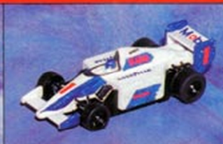
8792 INDY #1