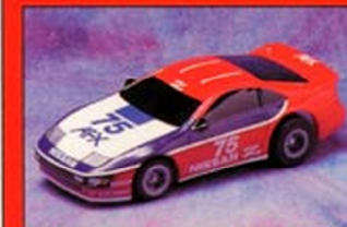
8701 NISSAN 300ZX