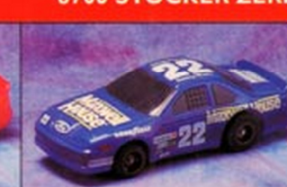
9121 STOCKER #22