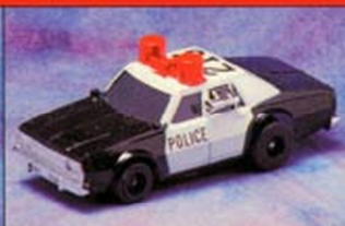
8764 POLICE CAR