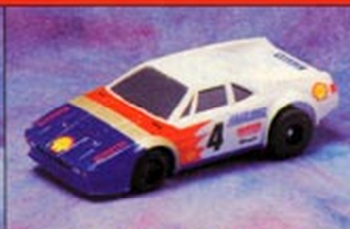
8794 BEAMER GT