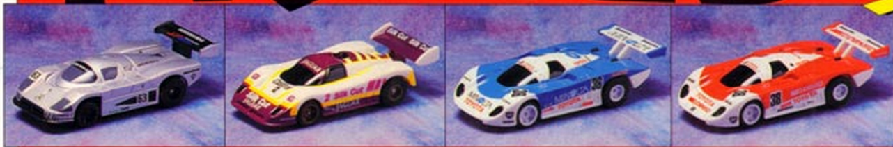
9201 MERCEDES C-9 9202 JAGUAR 9203 TOYOTA MINOLTA 9204 TOYOTA DENSO