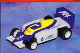
8758 INDY ROAD HAWK