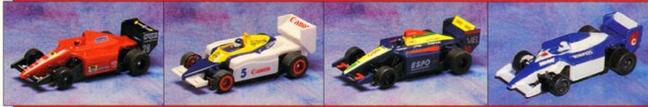
9209 FERRARI 641 9210 Wm RENAULT 9211 LARROUSSE F-1 9212 TYRELL FORD

Primus, the ultimate statement in H.O. scale slot car racing. Performance and beauty combined to create the most impressive cars ever made. Primus cars are so realistic, you'll feel as if you were in the cockpit racing at LeMans.