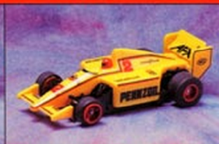
8702 INDY PENNZOIL