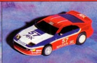
8810 NISSAN 300ZX