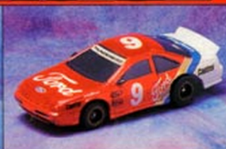
8753 STOCKER #9