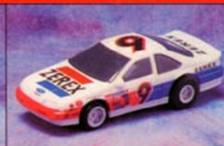
8706 STOCKER ZEREX