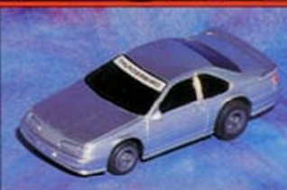
8752 SILVER STOCKER