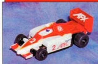
8759 INDY ROCKET