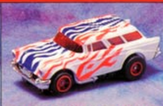
8795 WICKED WGN.