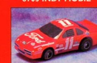
9120 STOCKER #11