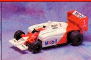
8703 INDY MOBIL