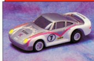
8793 TURBO 959