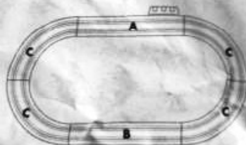
The Oval Track